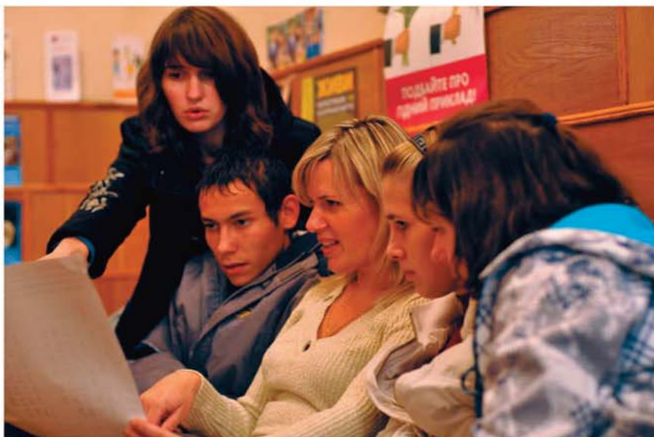
Meeting at "How to Become Successful" youth club in Pereyaslav-Khmelnitskyi

Ordinary flats will be used as the living space to prepare care leavers for independent life. These facilities will be organized to address the needs of the young people, in areas that are close to a family, work, studies and community.