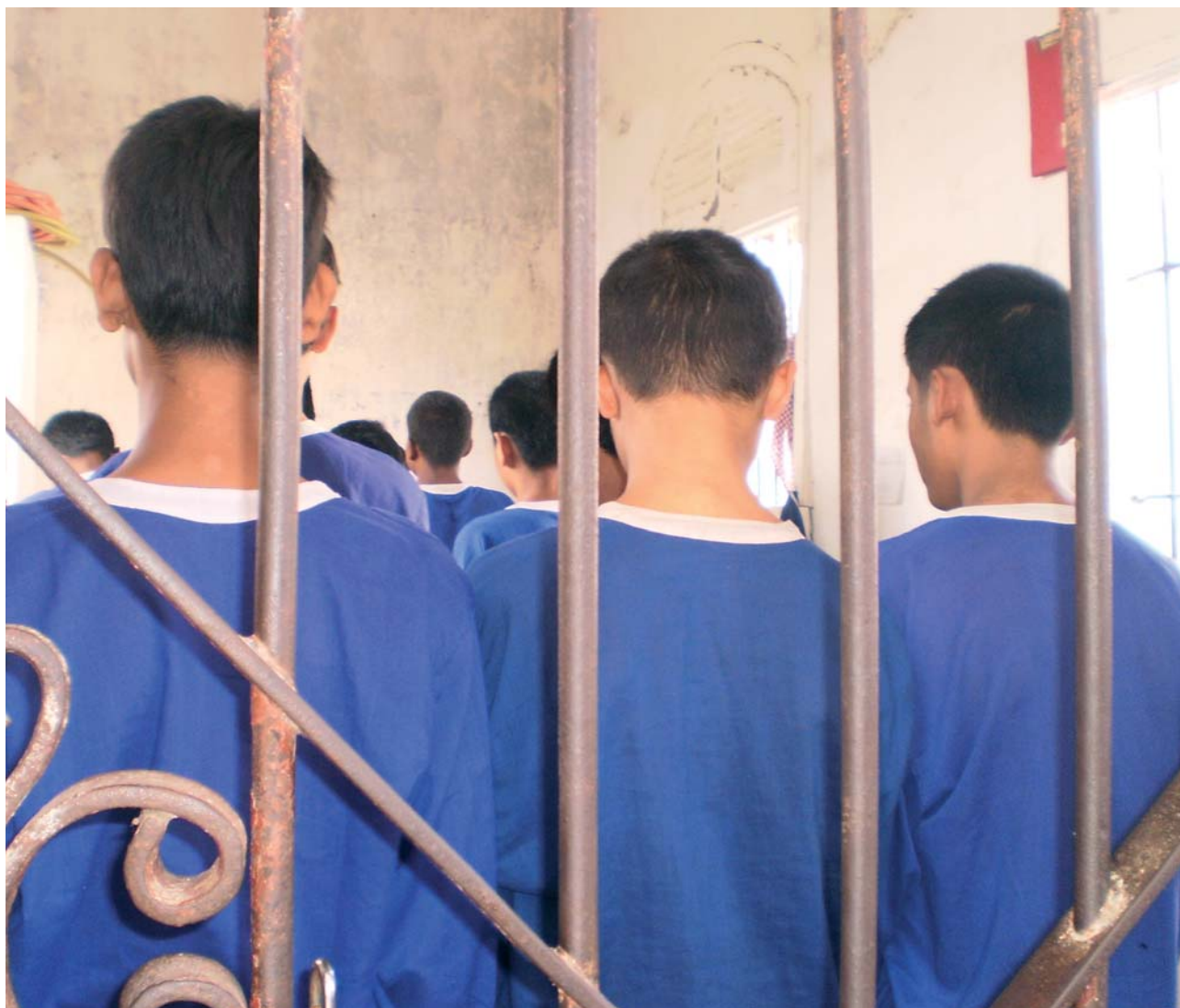
Minors in a provincial prison in Cambodia where they serve their sentences alongside adult prisoners.

EveryChild believes that there are an unnecessarily large number of children in detention, and that more needs to be done to reduce offending and to find alternative ways to punish and rehabilitate children who have committed crimes. It is also the case that some